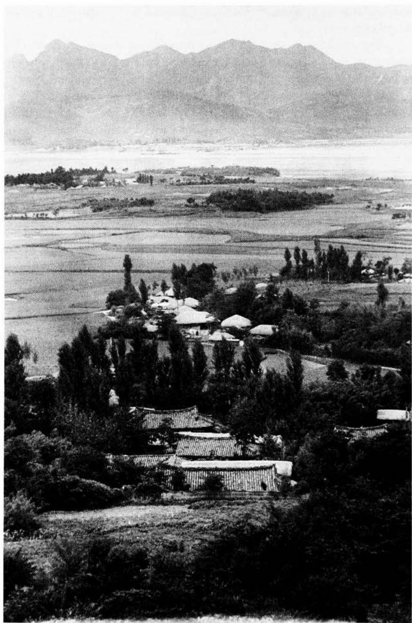
1.1. Scenes of Inch'on-ri