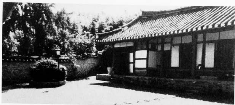
1.8. The Kim family compound in Inch'on-ri (above and opposite, top)