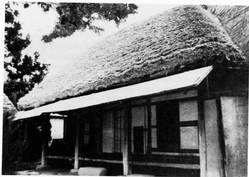
1.9. Part of the Kim family compound in Chulp'o