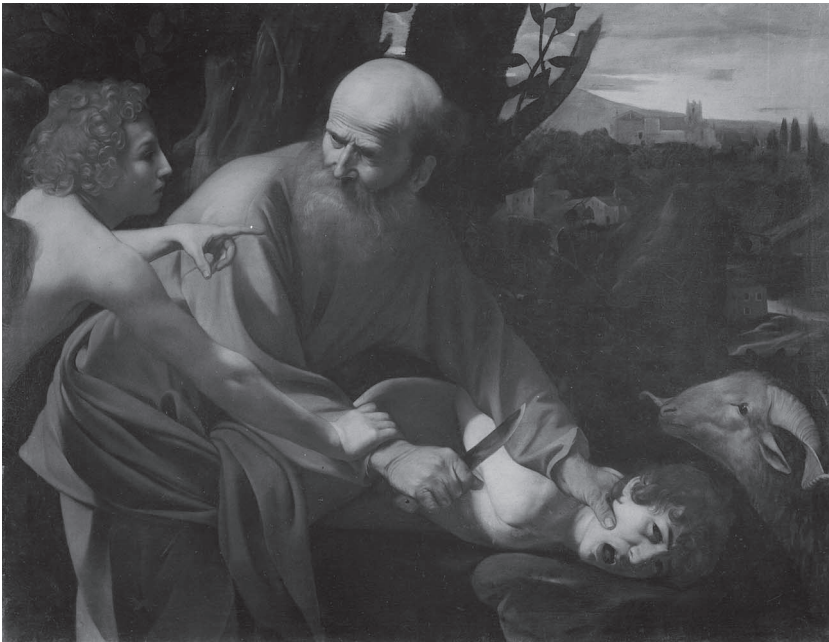
I.2. Caravaggio, The Sacrifice of Isaac (c. 1603). Oil on canvas, 104 x 135 cm. Galleria degli Uffizi, Florence.

The painting dramatically depicts a moment of interruption epitomized by the knife that hangs suspended in the air, a baroque gesture that we do not find in earlier pictorial depictions by Caravaggio in his The Sacrifice of Isaac (c. 1603) (I.2) or by Rembrandt's teacher, Pieter Lastman. 2 In both the Caravaggio and in Lastman's painting The Sacrifice of Isaac (c. 1612) (I.3, next page), which Rembrandt knew, the knife remains firmly in Abraham's hand, whereas in the Rembrandt canvas