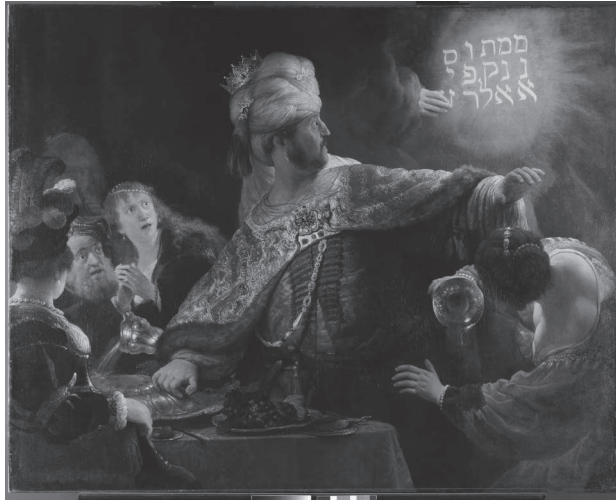
I.4. Rembrandt, Balshazzar's Feast (c. 1635). Oil on canvas, 167.6 x 209.2 cm. National Gallery, London.