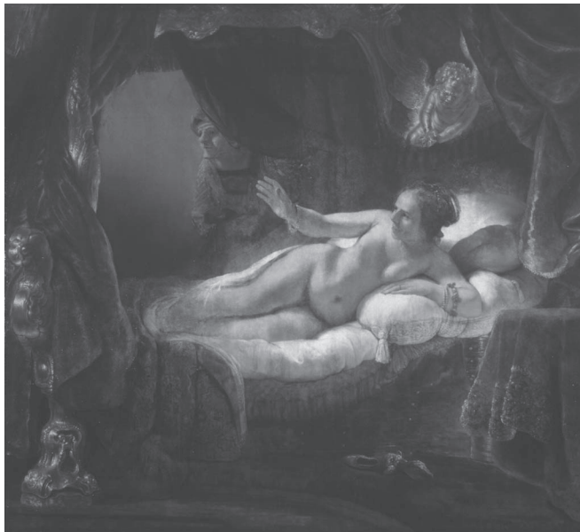
I.5. Rembrandt, Danaë (1636; after restoration). Oil on canvas, 185 x 203 cm. Hermitage, St. Petersburg.