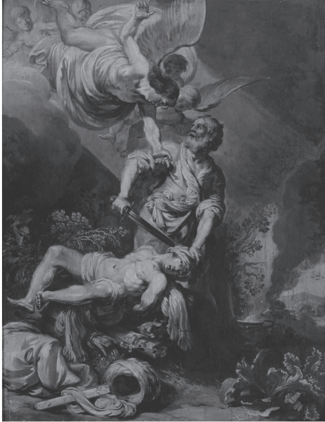
I.3. Pieter Lastman, The Sacrifice of Isaac (1612). Oil on canvas (grisaille), 183 x 250 cm. Rembrandt House Museum, Amsterdam.

it hangs in midair, having been dropped by Abraham, whose right arm the angel has seized, thus interrupting the apparently imminent slaughter. Violence, figured by the suspended knife, is thus dramatically interrupted in Rembrandt's powerful image, painted in the 1630s, at precisely the moment when Rembrandt was proving himself to be a "virtuoso of interruption." 3