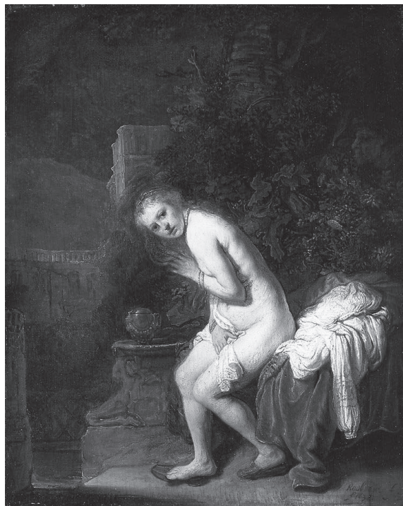
I.6. Rembrandt, Susanna and the Elders (c. 1634). Panel, 47.2 x 38.6 cm. Mauritshaus, The Hague.

Rembrandt's 1635 painting of The Sacrifice of Isaac is true to the biblical text, which tells of how the messenger of God dramatically interrupts the imminent action with that form of the negative imperative (לא 'al [“do not”] plus the imperative) that, in Hebrew, is especially