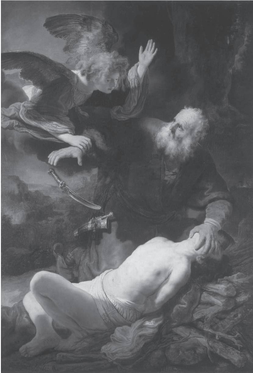
I.1. Rembrandt, The Sacrifice of Isaac (1635). Oil on canvas, 193 x 133 cm. Hermitage, St. Petersburg.