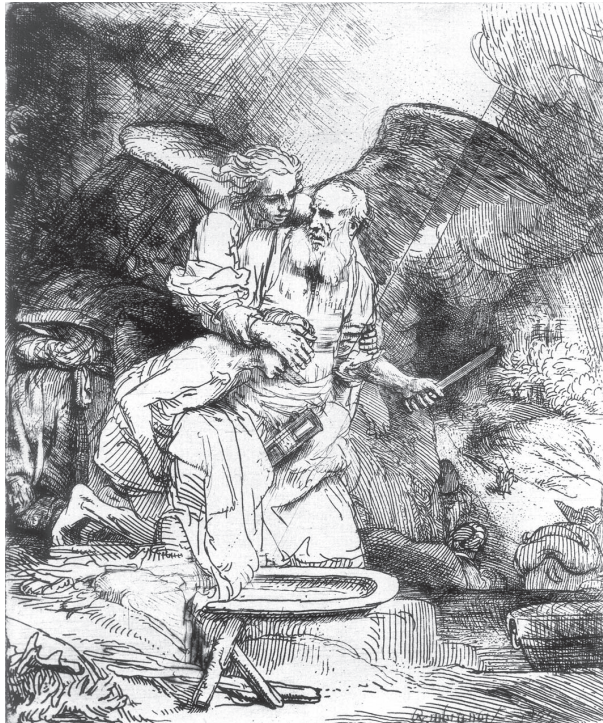
I.8. Rembrandt, Sacrifice of Abraham (1655). Etching and drypoint, 15.7 x 13.4 cm. National Gallery of Art, Washington, Rosenwald Collection.