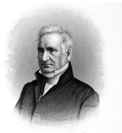
Figure 1.2. Eliphalet Nott. President of Union College

Much of the prestige that Union enjoyed during the first half of the nineteenth century was owed to its president, Eliphalet Nott (1773–1866). When Stillman was a student, he had entered his fifth decade as the college's leader (Figure 1.2). 67 A Presbyterian minister with a high reputation for pulpit