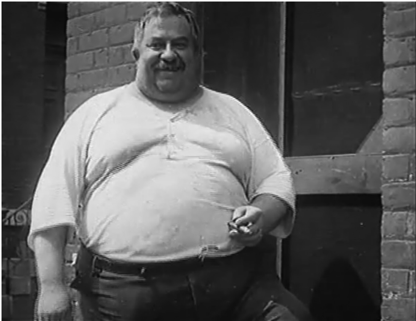
Figure 1.5. Local color on the Bowery (21:49).

in hand while Maggie and Owen trundle up the stairs and into the dark area. She shoos the kids away before pushing two, three, then four and five boys out of the dark space. Cut to the drunkards, in a complementary setting, exiting the tavern, then entering the brownstone (6:06–6:13) without interference, where more domestic violence ensues. 11 Jim tosses Owen out of the apartment and into the flight of stairs. He flees outside into daylight (08:50–09:02 and 09:06–11) in a sequence crosscut with shots of the wastrels (09:11–14) inside the apartment. Barefoot, in full daylight, he finds a place to curl up and sleep on a metal grate under the storefront of a bakery. In the implicit narrative the new life that inaugurates the next panel, also outdoors, could be a dream and a series of caricatures, even a memory-cloud, much like the local color the film discovers and records as the narrative unwinds. In one of the finest shots in the tradition of “realism” or depiction of “local color” on the Bowery, smoking a stogie, a grotesque spectator (whom Walsh or Benoit might have found while filming the sequence) enjoys either the making of the scene we are witnessing or the chaos of the world in which he lives (fig. 1.5).