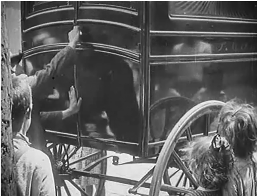
Figure 1.2. A coffin in a hearse: the filmmakers shown in their film (1:11).