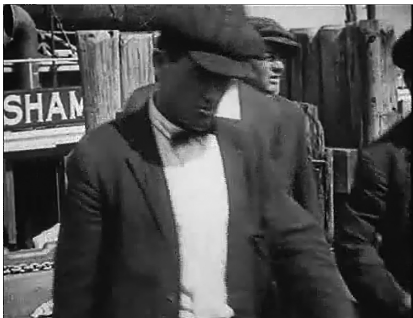
Figure 1.7. The SHAM of the Shamrock Queen (26:38).

Better known among historians, the shots recording the pyre and escape from the Shamrock Queen also oscillate between staging and verité. Walsh recalls how, after getting background takes of the Bowery and more at Fort Lee, New Jersey,