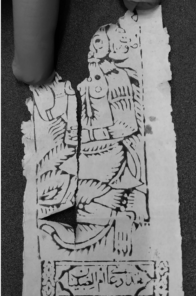
Figure 1.2. 'Umm al-Šibyān assuming the form of a cat.

In contrast, a qarīn lives only in the bloodstream of humans. With the notable exceptions of Syrian and Dagestani folklore, folk traditions have mostly substituted a qarīn for Qarīna. 70 Discrepancies between the oral and written tradition led Winkler to dismiss written